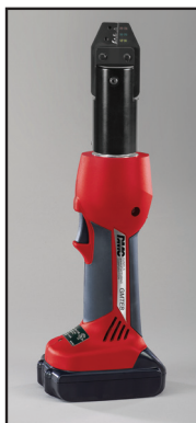
GMTExxxB Battery Tool

Custom tools are available. Consult DMC for details.