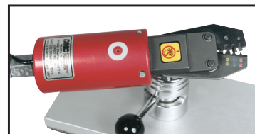
PMTxxx Pneumatic Tool

Custom tools are available. Consult DMC for details.