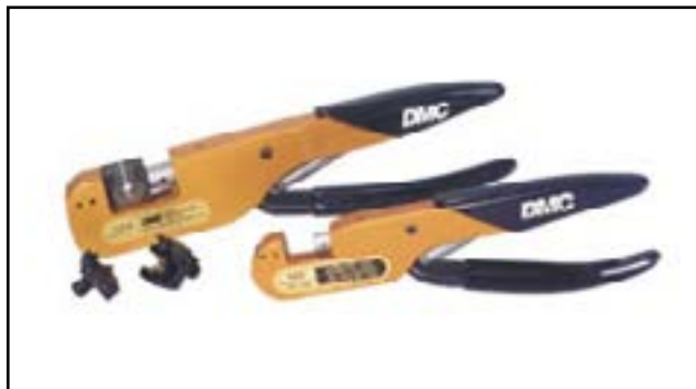
DMC169 (M83507/9-01) HX4 AND ACCESSORIES TOOL KIT

The DMC169 Tool Kit contains the HX4 (M22520/5-01) associated Die Sets for MIL-Spec shielding ferrules (MS21980/MS21981) and MIL-Spec coaxial contacts (MS39029/6/13/14, M39029/7/8, M83733/13/14 and ON089558). The kit is supplied in a metal case with foam inserts, contoured tool cavities, laminated instruction sheets permanently attached on a ring binder, and contents charts identifying the location of each tool.