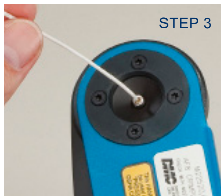
CLOSE / OPEN HANDLE