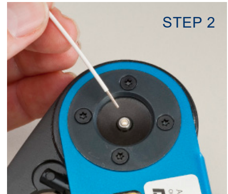
INSERT PRE-STRIPPED WIRE