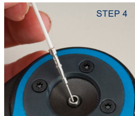
REMOVE TERMINATED WIRE ASSEMBLY